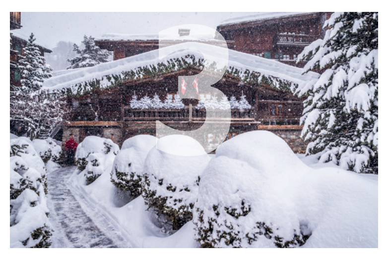
In winter, the Fer à Cheval is the ideal location for skiing and other winter activities – and the perfect place to enjoy a luxury retreat and Alpine hospitality

The fact that we are the only hotel in Megève with two swimming pools – one indoor and one outdoor pool in summer – certainly adds to our year-round popularity.