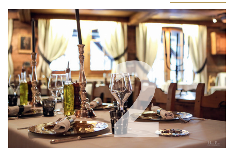
Guests to the Fer à Cheval appreciate the excellent cuisine of its traditional restaurant and its fine selection of 270 French and international wines

Although we offer luxury, we have always maintained our warm and welcoming character. The Fer à Cheval is a family business.