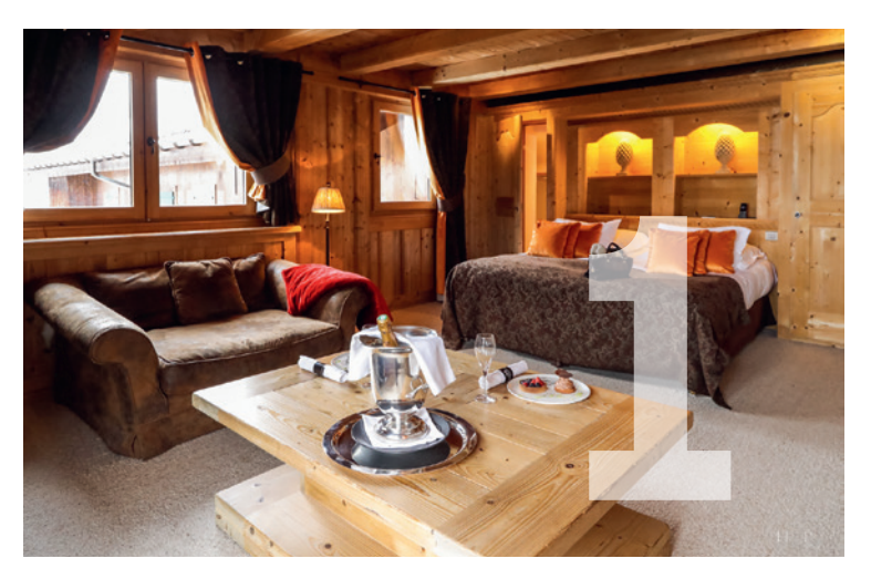
Each of the hotel's 53 rooms and suites is unique and invidividual, warm and welcoming with natural materials such as old wood and stone

Now as before, winter is the main season for the Fer à Cheval, says the Managing Director. "Some people believe there is no snow